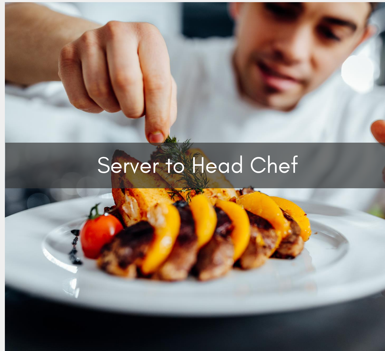
Server to Head Chef