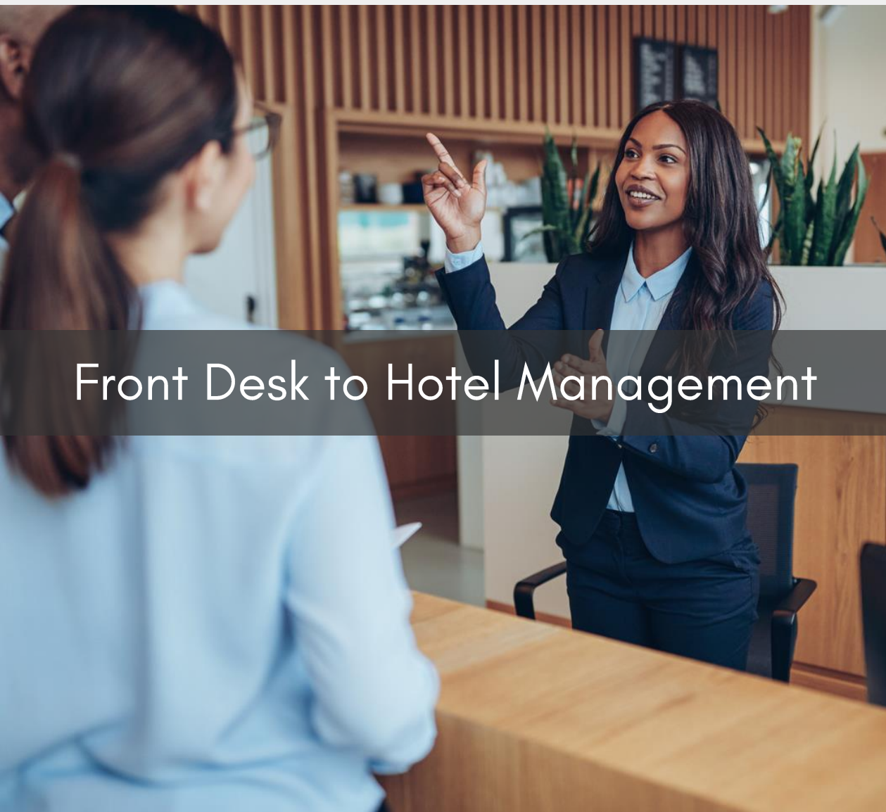
Front Desk to Hotel Management

The goal of this initiative is to present hotel staff as well as our future workforce in hospitality with career pathways that support growth and an increase skills.