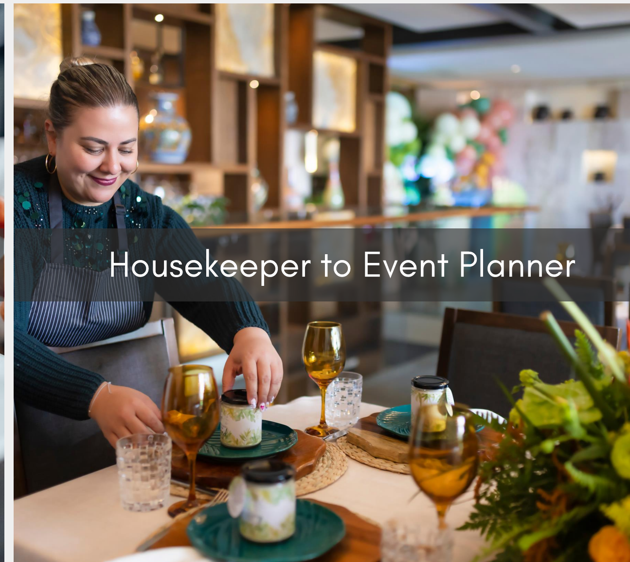
Housekeeper to Event Planner