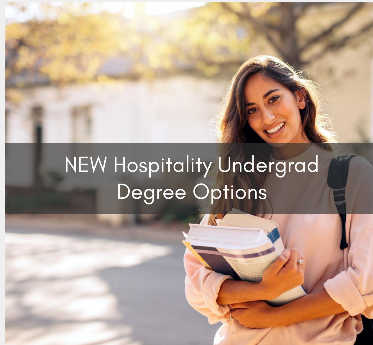
NEW Hospitality Undergrad Degree Options