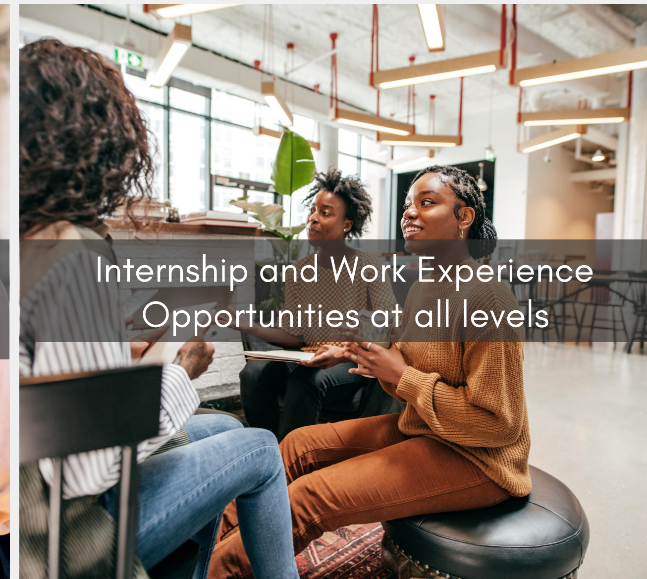
Internship and Work Experience Opportunities at all levels