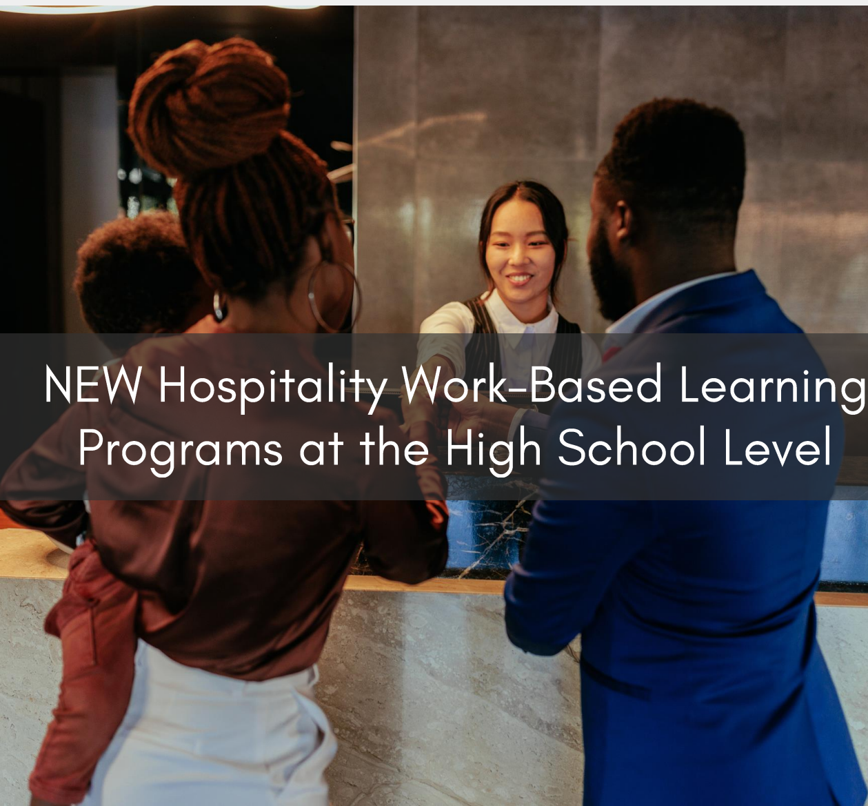
NEW Hospitality Work-Based Learning Programs at the High School Level

Through strategizing and working together with local and industry partners, we are currently building the following new programming: unique to the Battle Creek Doubletree Hotel and created with the community and career mobility in mind: